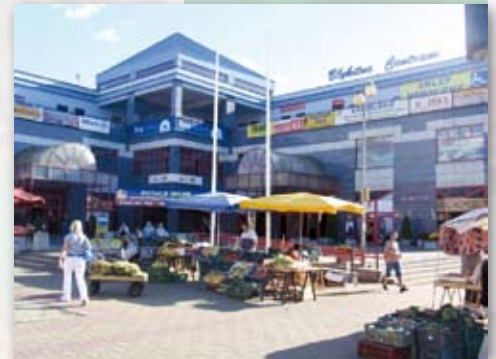
Legionowo shopping centre