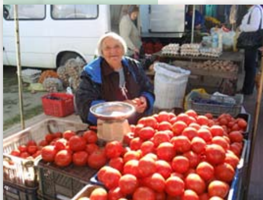
Legionowo Saturday market

I finished Seminary in Warsaw but was not satisfied. I started searching the internet for a reformed college and came across London Theological Seminary. I already knew that God was calling me to serve him full time and that seminary seemed a right next step for me. We moved to London in 2006 and I started the seminary in 2007 and finished this year. God has been very gracious to us and as the time was passing the question was: 'What shall we do next, Lord?' He gave us an answer. We knew without a doubt that we had to move back to Poland to serve Him, but in the beginning we didn't know how we should serve him. The answer came - start church planting in the town of Legionowo. Both of us knew that this was our calling from God.