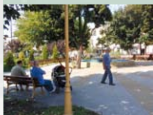
Legionowo town square

Legionowo has 50,000 inhabitants and there are no Protestant churches, just a Jehovah Witness Kingdom Hall and a couple of Roman Catholic churches. There are only a few reformed churches in Poland. We desperately lack preachers. Those who are in ministry, and are faithful, mostly struggle to survive financially, and support themselves with another job. Charismatic churches draw young people, other Christian churches are more full of the older generation. Poland is 95% Roman Catholic but many already stopped attending the church, not finding there anything else except politics and priests who want only money. Poland has never experienced revival on such a scale as the UK, therefore we have much to learn from your preachers.